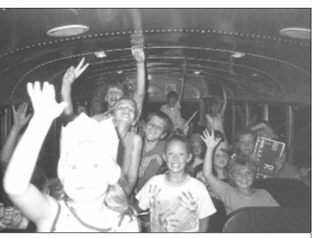
KIDS ON JOY BUS

In nine and one half years the Walled Lake Congregation's